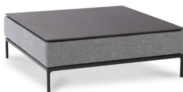
tafel SHIVA JR-t396