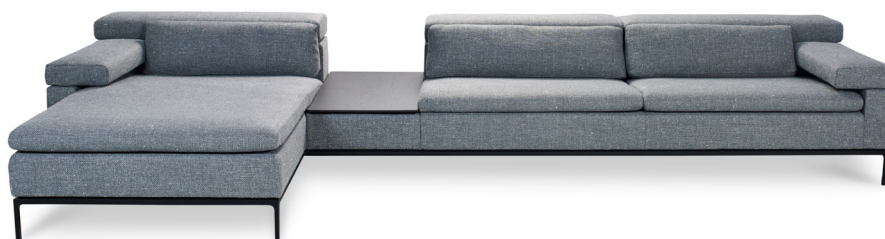
model: SHIVA JR-3960 - design: Jean-Pierre Audebert

40 years later, SHIVA has stood the test of time and is still a bestseller in the JORI range after a few slight design and comfort tweaks.